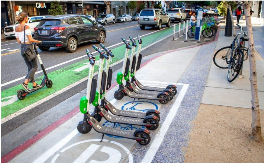
Figure 4. Designated e-scooter parking zone.