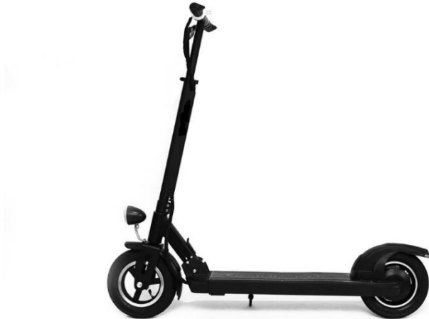
Figure 1: Illustration of a typical e-scooter

E-scooters are also available to purchase for private use across Australia. Suppliers sell e-scooters with a disclaimer for users to consult the relevant legislation regarding operation.