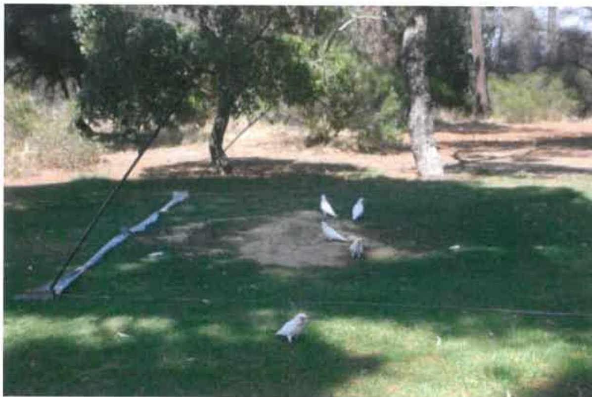
Figure 2 Example of a dummy set. The net has been replaced with hessian, moving parts are replaced with blocks of wood and bungees replaced with rope. Corellas are shown feeding on grain in the feed site within the catch area.