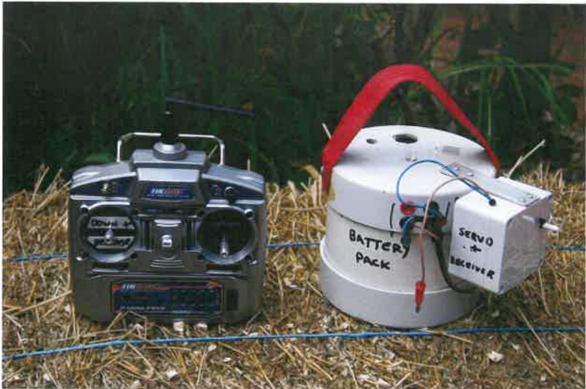
Figure 5 The transmitter (left), and the receiver/battery pack (right). The battery pack, servo and receiver have been combined into one unit for convenience.