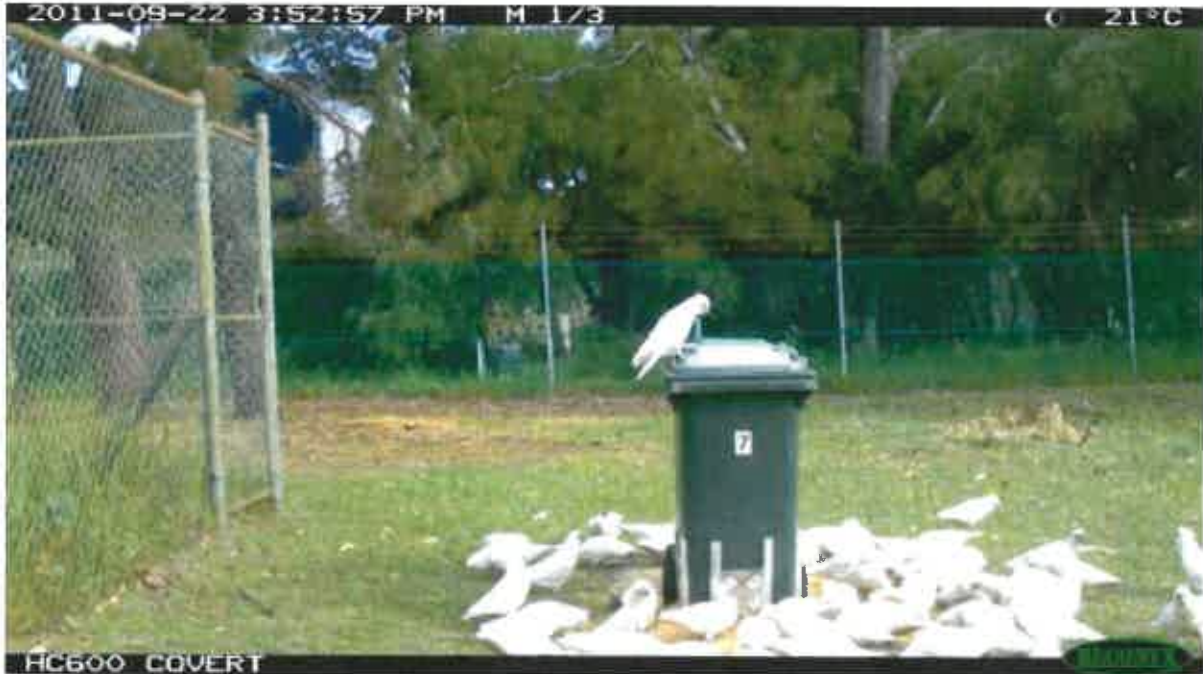
Figure 1 Image taken from a Reconyx Hyperfire HC600 camera set up at a feed site including the time of day. This image shows a feeder that can be used when daily hand feeding is not possible. Note the secure fencing and thick bush in the background to restrict public access and viewing.

Non-target species such as magpies, pigeons or ducks may also be attracted to the feed site. This can be helpful as corellas will notice them feeding and come to investigate. If non-target species continue to visit the feed site, consider changing the food type to a specialist parrot feed such as sunflower seeds. Generally only parrots and cockatoos can de-husk sunflower seed so this should attract less ducks compared to a feed site with only wheat.