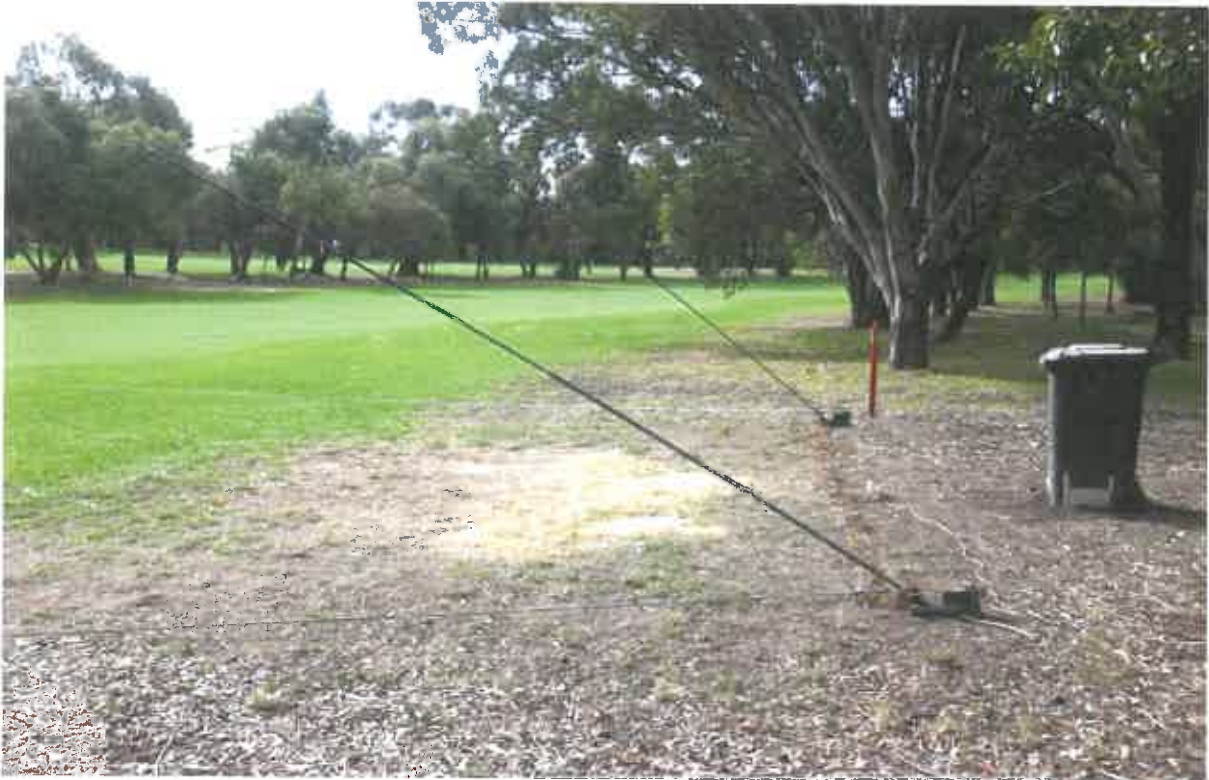
Figure 3 Catch area with the net set and ready to fire. Observations have determined that birds using this site approach from the left and this is the direction the net will fire. Note: the feeder has been moved out of the catch area, but not completely removed so that the site appears similar to what the target birds are used to.