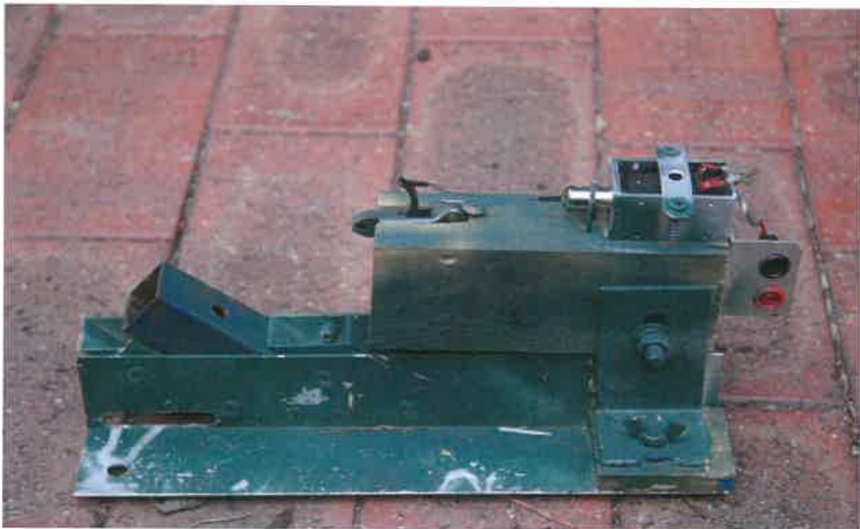
Figure 4 The release mechanism showing from left to right, the guide pole base set at a predetermined angle, the bow-string release, the solenoid and the electrical plug ports.